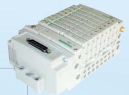
Remote piloting with the islands